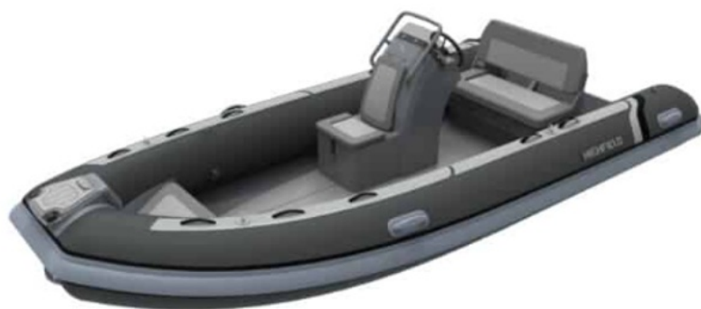
Actual Colour Scheme (Storm Grey)